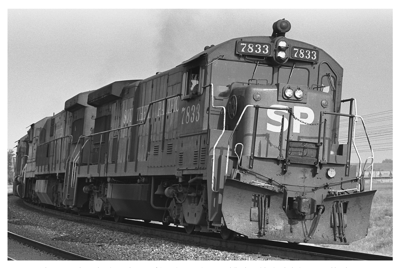
A heavy westbound waits at the top of San Timoteo Canyon while the mid-trian help is removed back at Beaumont.

With four of a kind in the number boards, a westbound B36-7 and two SDs pass light eastbound help at Apex.