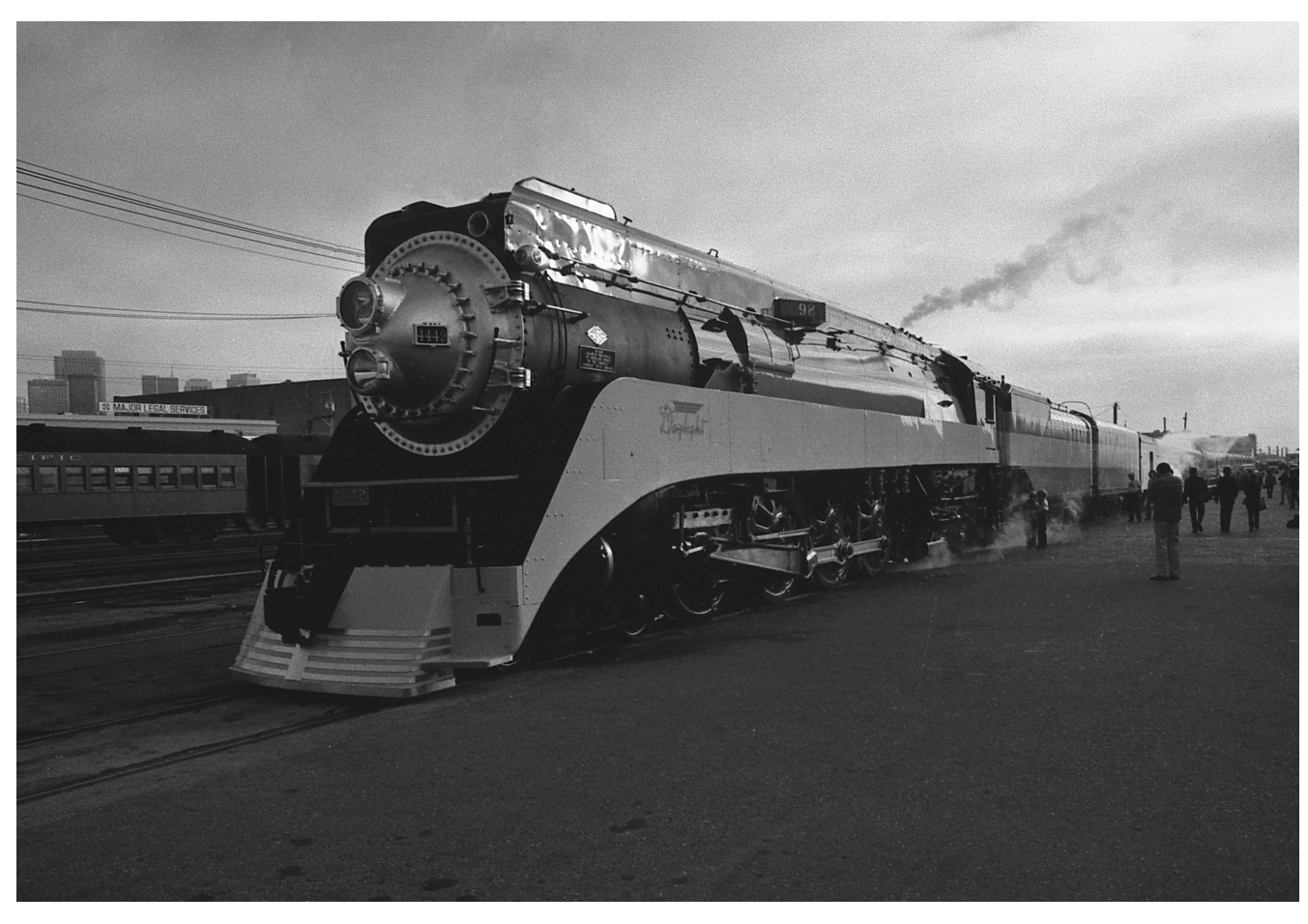
The World's Fair Daylight awaits departure time from San Francisco.