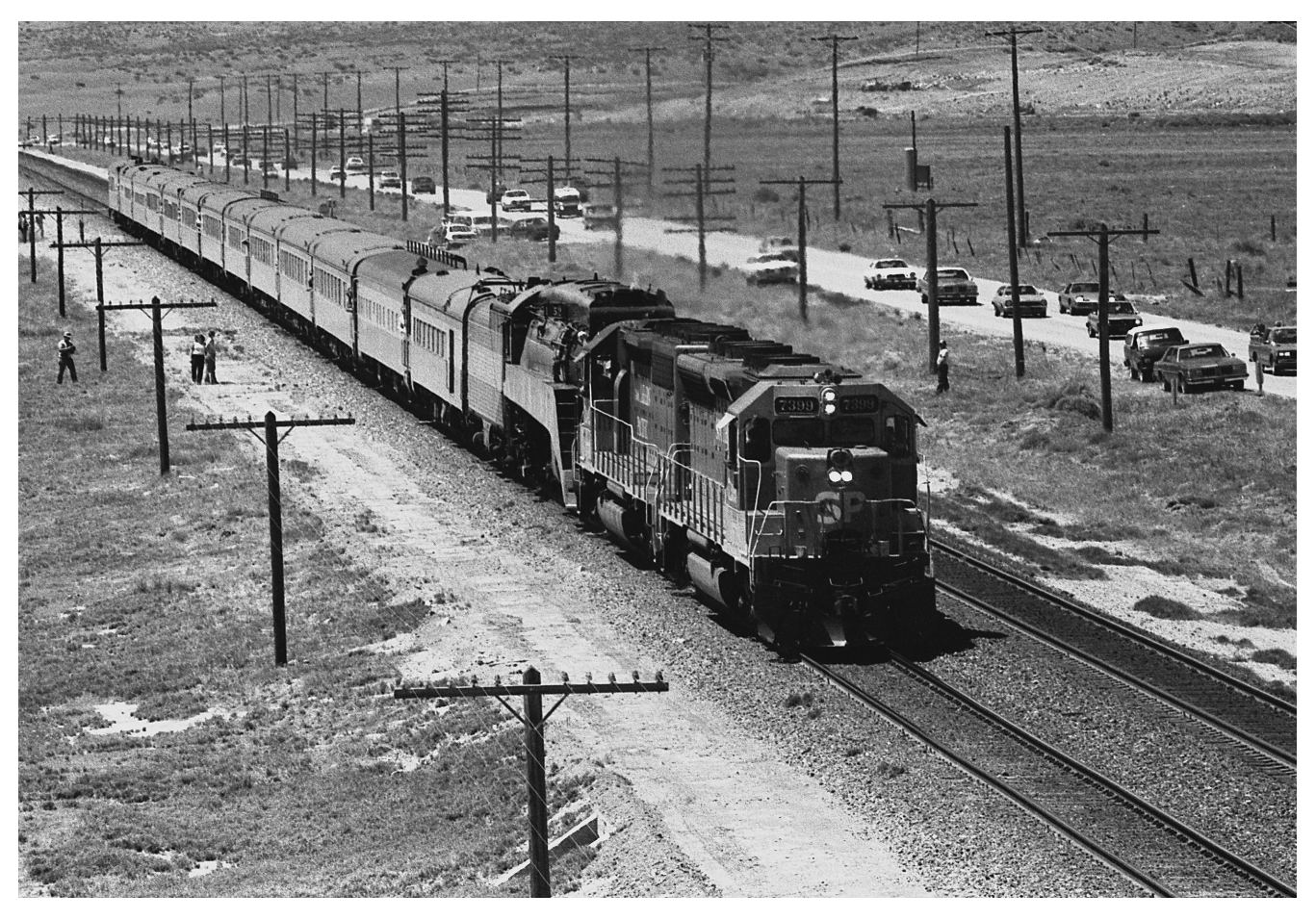
With the helper team painted to match, the World's Fair Daylight drops eastbound off the Tehachapi Mountains, 1984.