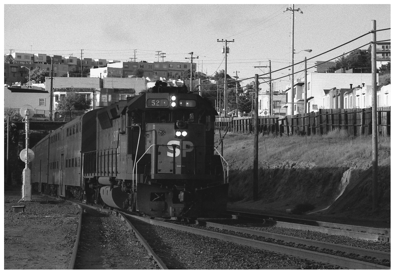
Five miles out of San Francisco, one of SP's three GP40P-2s hustles an evening rush hour commuter at Bayshore, 1985.

A seven unit westbound climbs Beaumont Pass at West Palm Springs past a work extra in the hole.